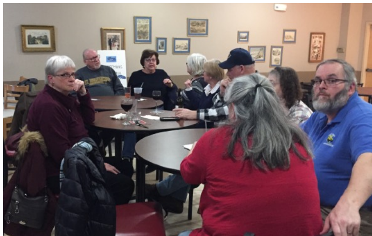
Friday night social at the Knights of Columbus