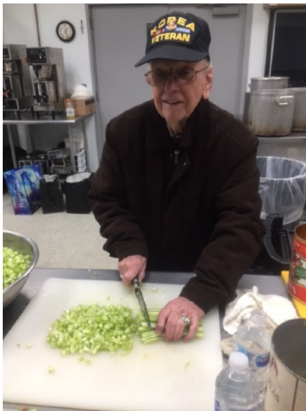
One of our 90 year old Veterans preparing our Famous Veterans Freedom Chowder for the February 1st Saratoga Chowder Fest.