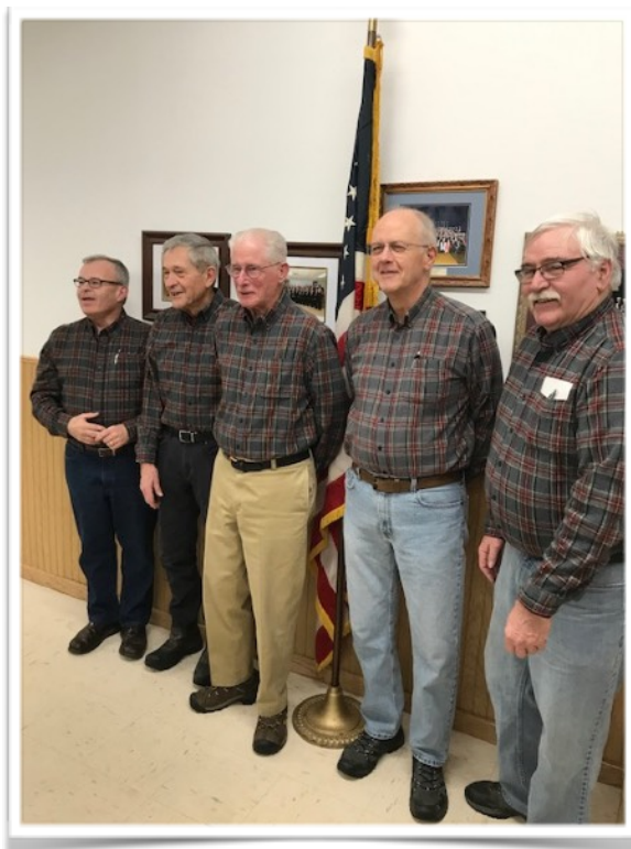
KNIGHTS NEW 4TH DEGREE PLUS UNIFORM