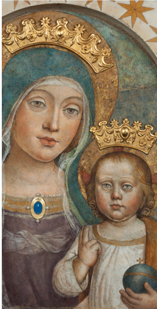
The ancient fresco of Madonna del Soccorso (Our Lady of Help) in St. Peter's Basilica was restored with the support of the Knights of Columbus to mark the Year of Faith (2012-2013).

O Mary, you always brighten our path as a sign of salvation and of hope. We entrust ourselves to you, Health of the Sick, who, at the Cross, took part in Jesus' pain while remaining steadfast in faith.